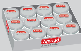
Tray 12 GLASS JARS