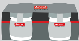
Set of 2 GLASS JARS 180g